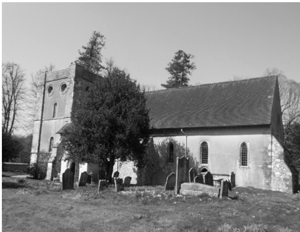
Warnford Parish Church: hugofox.com