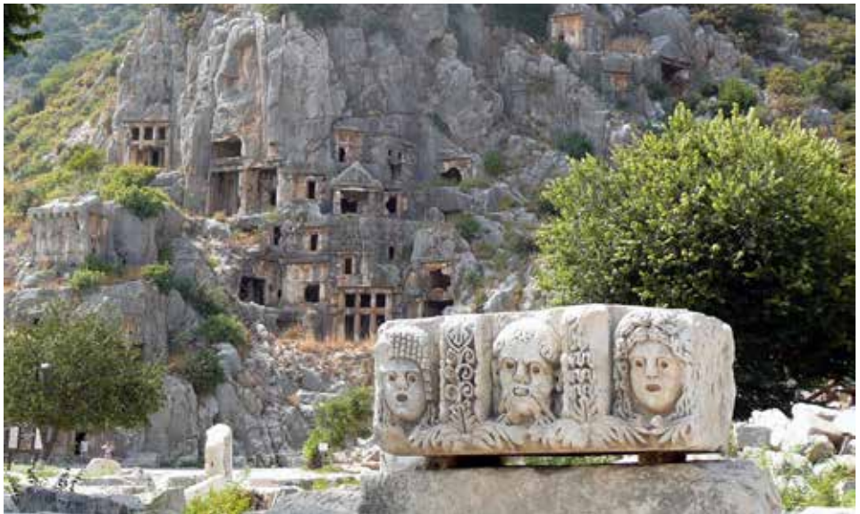
The Lycian rock tombs at the Byzantine church of St Nicholas in Myra

Nicholas' determination to remain anonymous in his giving, even dropping the bag of money for the last daughter down the chimney, gives us something to think about. At this time of year, when our minds are preoccupied with Christmas shopping, presents and January sales, we can ask ourselves for whom we really do all this? Do we truly have others in our hearts?