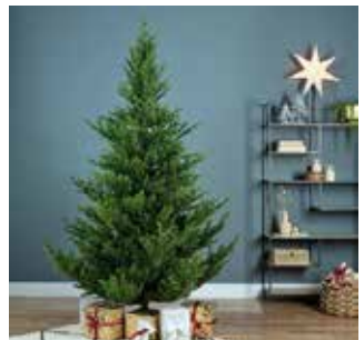
Spruce up for Christmas. NB. not on sale from WMVS.