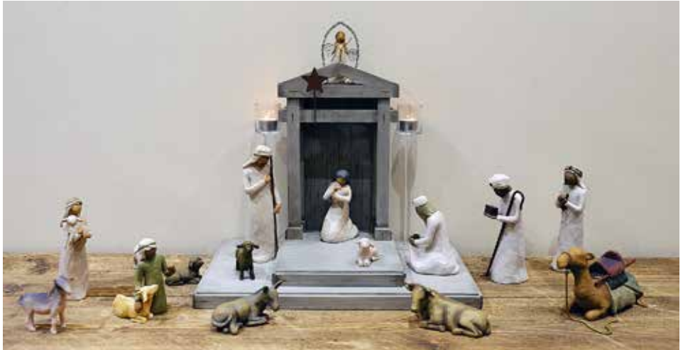
Warnford nativity decoration