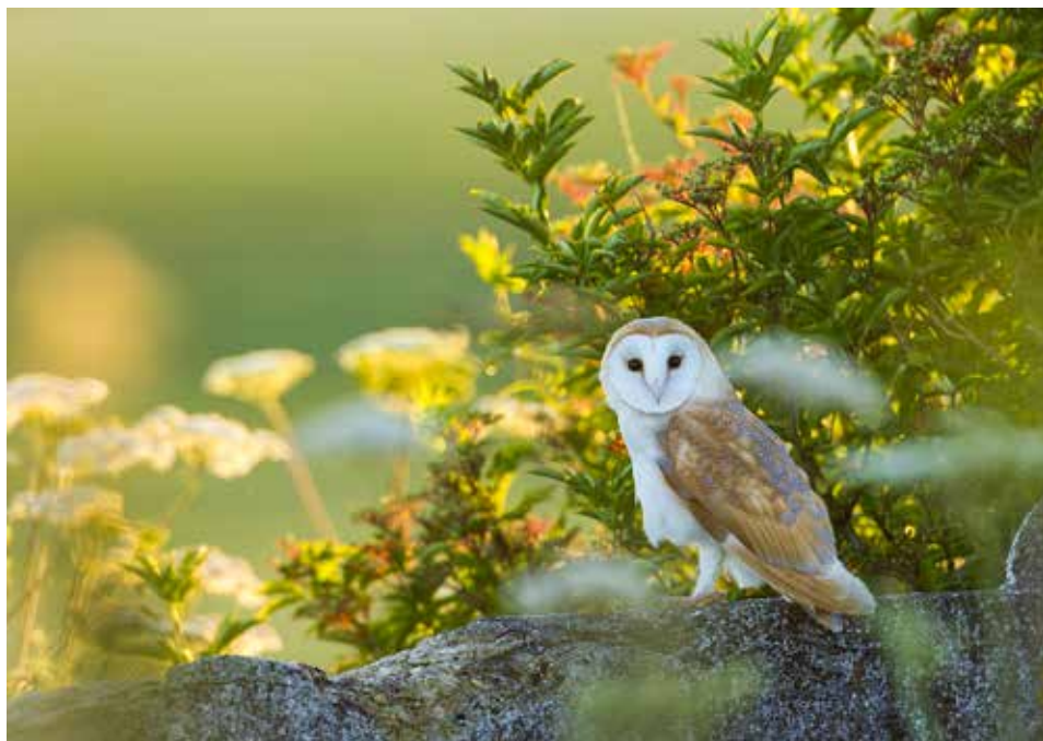
Barn Owl

Owls are among our most captivating birds and, with a good view, are easily distinguished from other UK birds. But how to tell one owl from another? Here's a guide to the UK's five resident species: