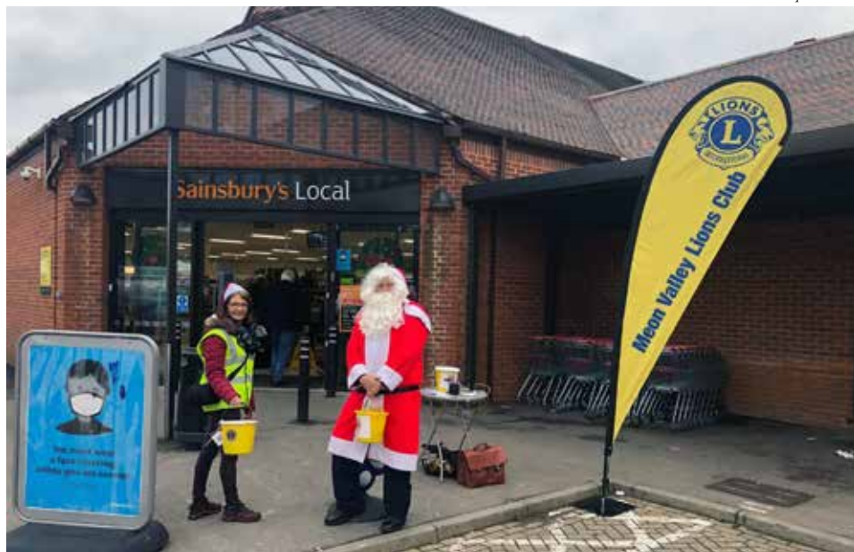
Photo: Santa at Bishops Waltham

Despite only spending half the time 'on the road' helping Santa and his Elves raised a grand total of £4,213.37. Everyone gave a warm welcome and generously donated, not only at our door-to-door collections but at our static collections, outside local retail outlets. We'd like to say a huge thank you to everyone who donated.