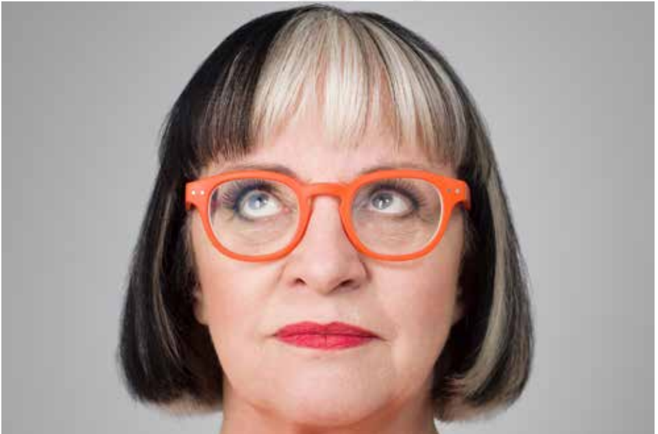
Another Philippa - Philippa Perry of Good Morning Sunday

Why am I telling you all this you may think? Well, basically I am getting round to the fact that it couldn't continue. There came a time when I had to face the fact that the grey was getting more, the real brown less and unless I wanted to be using chemicals every week I had to stop. (I think that post-Lockdown I am not the only one!)