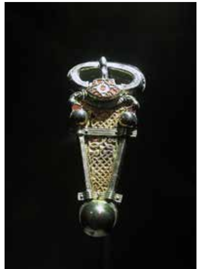
The Anglo-Saxon Buckle in the Curtis Museum

www.hampshireculture.org.uk/allen-gallery Jill Line