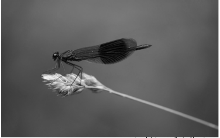
Banded Demoiselle

The name for these species together is Odonata, and they are closely related. There are 46 species that either regularly breed in Britain or are common migrants from Europe, with a further ten occasional migrants. They come in a huge variety of colours and sizes and will visit all sorts of freshwater habitats.