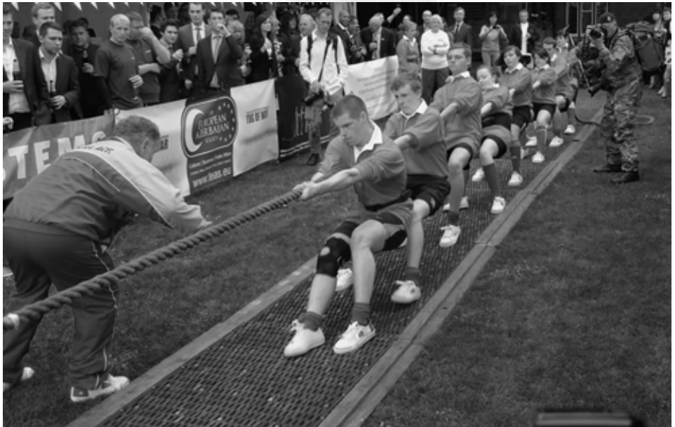
Cadets take part in tug of war competition