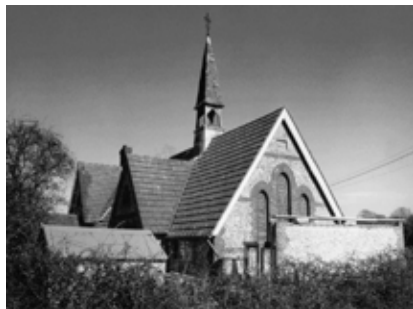
Woodlands Chapel