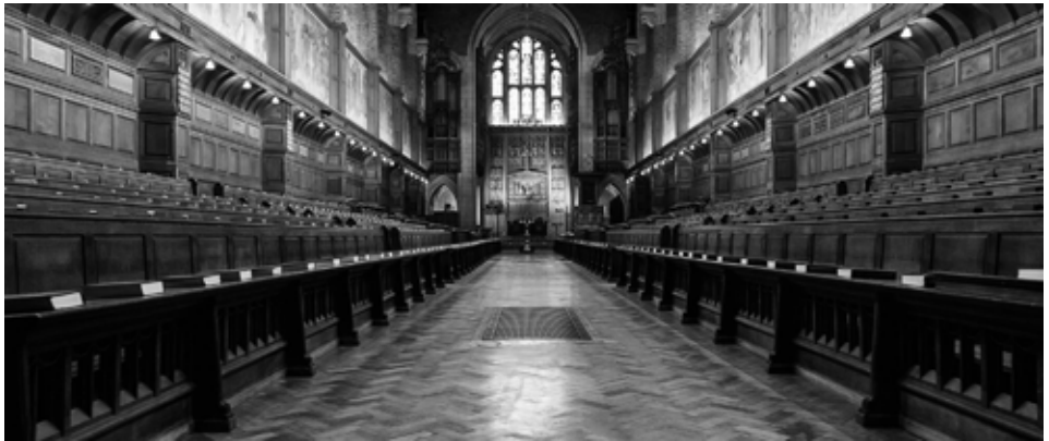
Christ's Hospital Chapel, Horsham