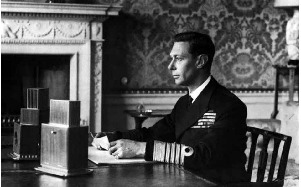
King George VI Christmas message 1939

from slavery in Egypt to freedom in the Promised Land they spent a lot of time complaining that life was now even worse; 'At least in Egypt we had food to eat. Why can't we just go back?' There is safety in the familiarity of what we know.