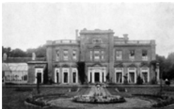
Warnford Park: losth heritage.org.uk

https://edwin234.wixsite.com/wwwgardencountryside