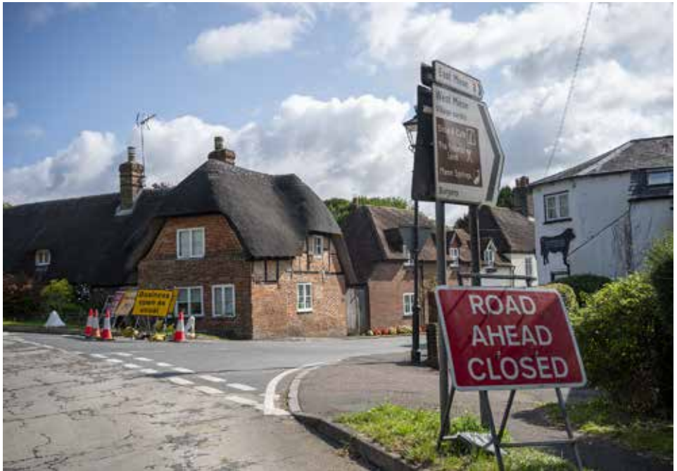
A32 West Meon High Street junction

In September, schools across the land respond to all the wonderful things that occurred over the summer, such as the exciting places visited and the great achievements of the students in sports, the arts and in public examinations and much more besides. They will also be working hard to welcome new staff, students and pupils, especially, making them feel valued in their new community.