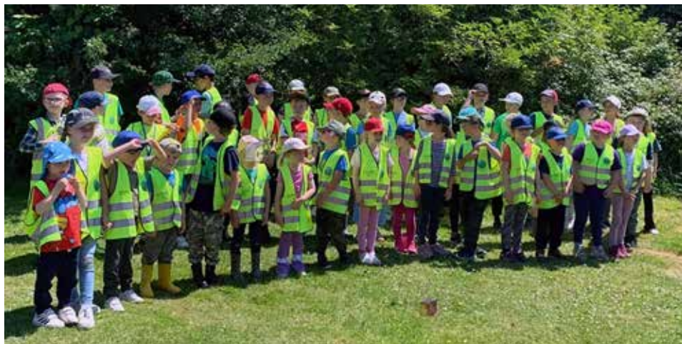
Stubbington activity day: from J Kelly

As well as Y5 having a fabulous and sun - drenched week at Stubbington Study Centre, the whole school went down for the day and had an amazing trip doing beach and pond studies. It is so lovely getting away as a whole school and the Pantomime in Winchester is already booked .