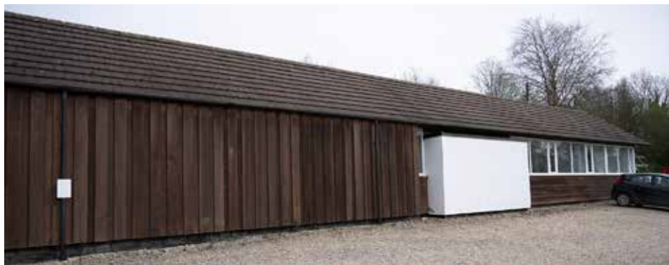
West Meon Village Hall: A Annabel

The West Meon Village Hall was officially opened in 1964 and this September we will be celebrating its 60 years with a 'Diamond Jamboree' of events for you to enjoy on Saturday 21st September. The day begins with a pop up café, featuring delicious coffee and cake prepared by the WI, who use the hall for their monthly meetings. We will hold a Flower Arrangement Competition - Garden flowers/Greenery arranged in a container of your choice. Please drop off entries to the hall between 10-11am. Judging at 11:15am.