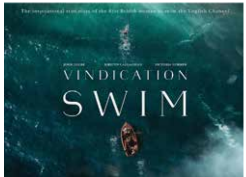
Vindication Swim: Outdoor Swimming Society