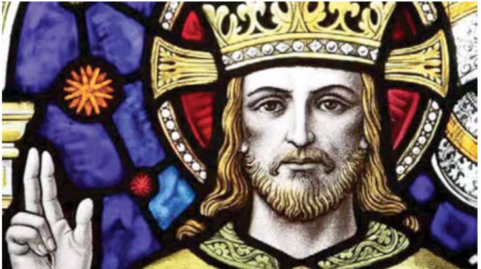
Christ as King in the seminary Dunwoodie, New York

The festival was introduced at a time of rising fascism and communism in the early 20th century, so the intention of introducing this celebration at the end of the year was to affirm the