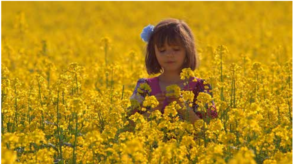
Rudy (2023) IMDb

A Bonfire Supper £7/head is available from 6.45pm. Tickets either online or in the village shop, must be booked by Wednesday 6th.