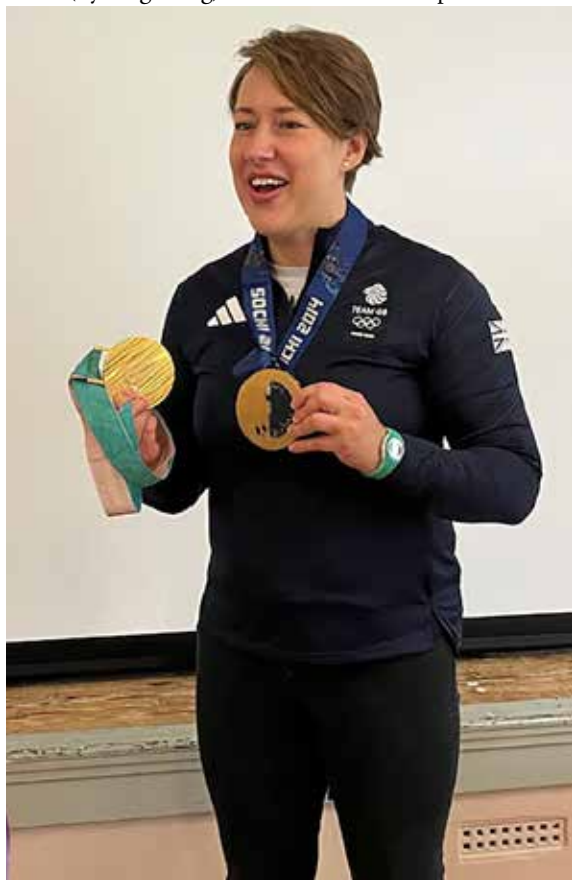
Lizzie Yarnold holding up her two gold medals at the West Meon WI meeting.