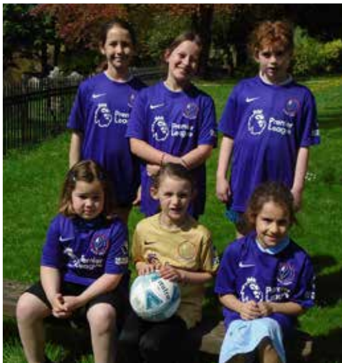
West Meon Primary School Girls' Football Club

The new YR parents and current YR parents are invited to a coffee morning on the 27th June and then the new YR children will come in for several story time sessions, before joining us for Changeover Morning on 18th July. We have a few places for Year R and across the school in September. Please look at our website to see all of the activities we offer.