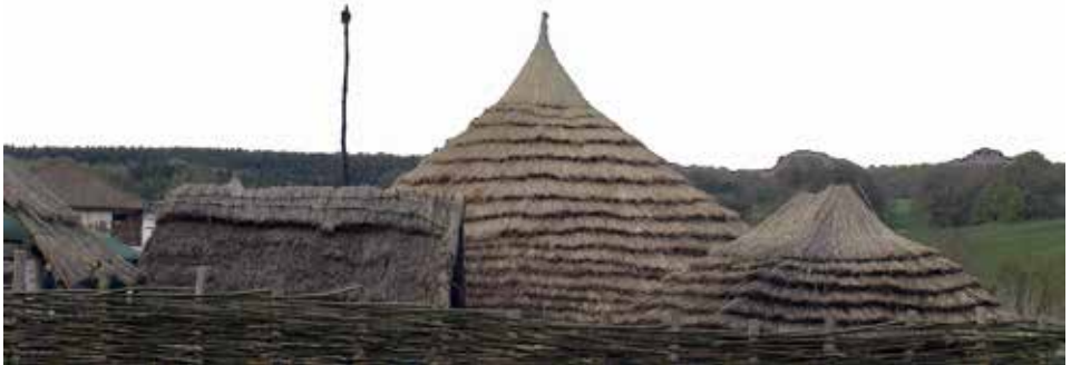
Butser Ancient Farm (NB, not location of service): A Annabel

11.30am Langrish on Butser Hill. Service of the Word with bring your own picnic. If not fine weather: in Langrish Church.