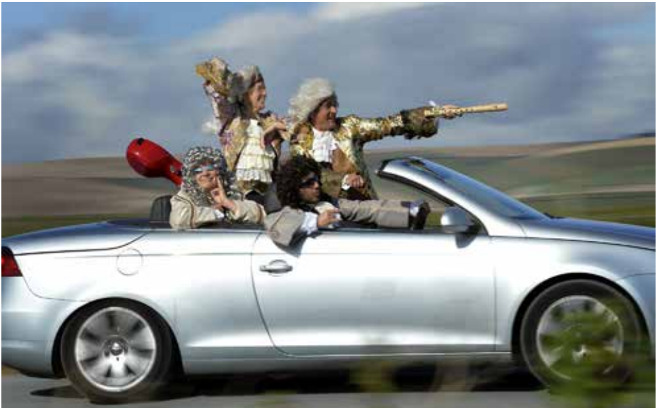
Photos: Primrose Piano Quartet (top) and Red Priest (Handel in car)

While most concerts are held at West Meon's St John the Evangelist Church, the festival also extends elsewhere into the Meon Valley. Cutting edge baroque quartet Red Priest (named after the original "red priest" – Antonio Vivaldi) have been delighting audiences across the globe since 1997 and will be bringing their unique style of high-energy performances and theatrical presentation to East Meon church on the morning on Saturday 14th September. "Truly Madly Baroque" will explore themes of love, joy and