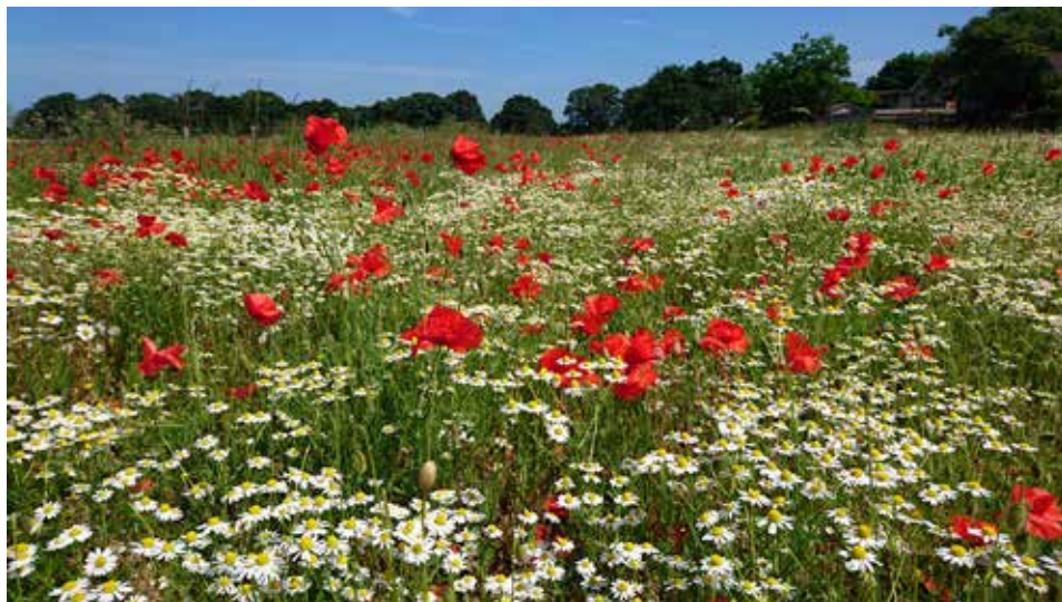
Barton Meadows Nature Reserve in flower

The Wildlife Trusts manage around 2,300 nature reserves across the UK, ranging from an entire mountain in Scotland to a single ancient hawthorn tree in Norfolk. Locally, Hampshire & Isle of Wight Wildlife Trust manage over 50 nature reserves, including expansive moorlands, ancient forests, stretches of coastline, wildflower meadows and small patches of wildness in urban areas.